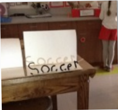
CREATING SHADOWS IN 4TH

Fiber Arts Center. Thinking ahead, slowing the process down and creating meaningful work is joyfully happening everyday!