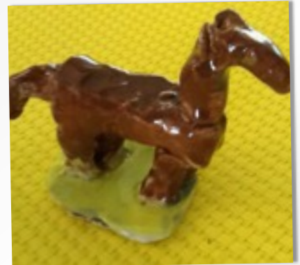
EXPLORING PERSONAL INTEREST