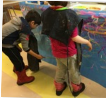
PAINTING TO MUSIC IN 1ST